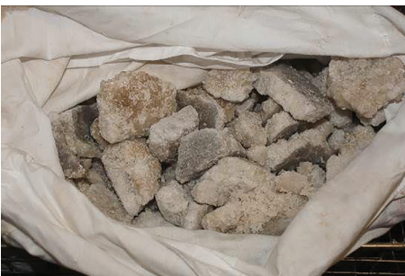
Calculation yield: approx. 1 300 000 MDMA tablets (120 mg concentration, average).