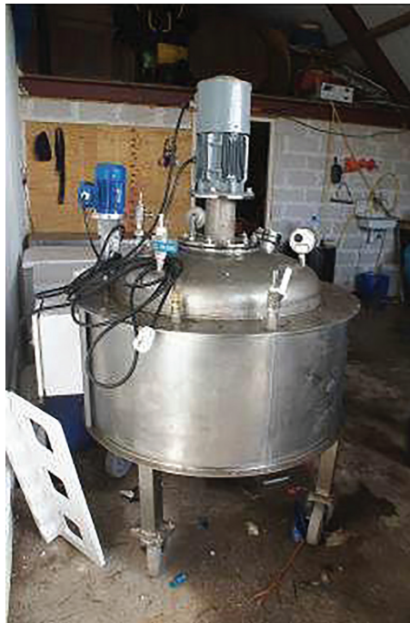
Similar equipment was seized in two locations, which was used for the illicit synthesis of mephedrone. As final product, 26 kg of mephedrone crystals were seized.

These combination sites (where two different products were being manufactured) clearly indicate that OCGs are not just limited to illicit sites where manufacture of traditional synthetic drugs takes place. They use opportunities and market demand to generate more profits.