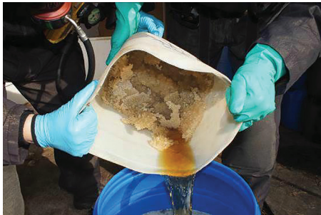
160 kg of MDMA were seized.